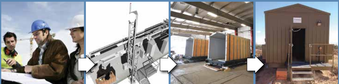
Planning and Specifying Design

We provide a complete engineered package including building and structural steel design, electrical, instrumentation, mechanical equipment and piping installation, construction and testing. Our rigid QA/QC and project management processes ensure that a quality product is delivered every time.